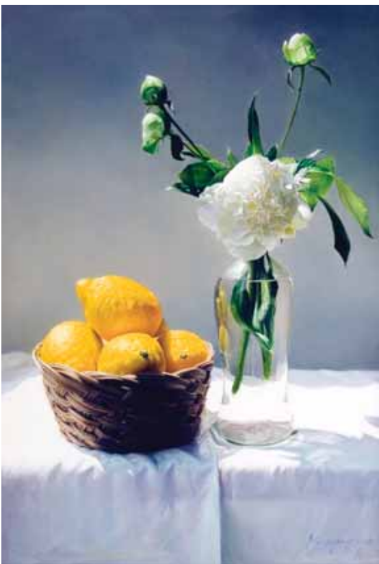
YING ZHAO, PEONIES AND LEMONS, OIL ON CANVAS, 30 X 20"

“There are not too many colors. Blue and white are the ones I use for this piece,” says Plam. “One blue is a dark blue, then a lighter blue and then white is included in the next blue. The Lunaria goes into the background, but at the same time it comes together with the white on the little cup. It also creates a brilliant contrast with the dark blue when they are over the dark blue tea pot.”