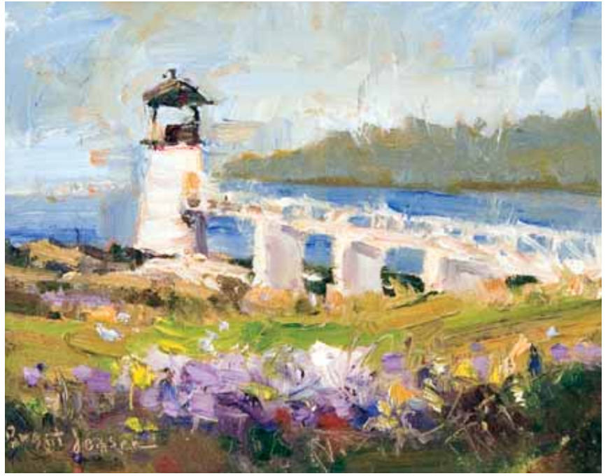
BRENT JENSEN, LANDS END, OIL ON CANVAS, 8 X 10"