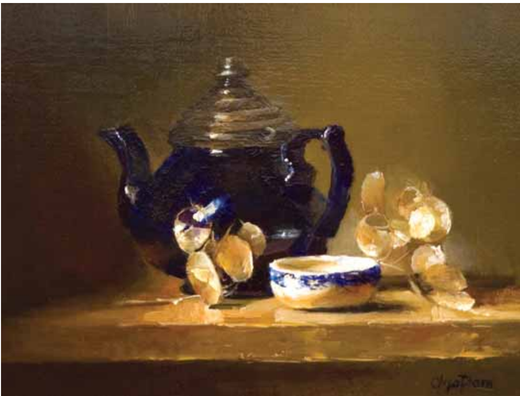
OLGA PLAM, ARRANGEMENT WITH LUNARIA, OIL ON BOARD, 9 x 12"