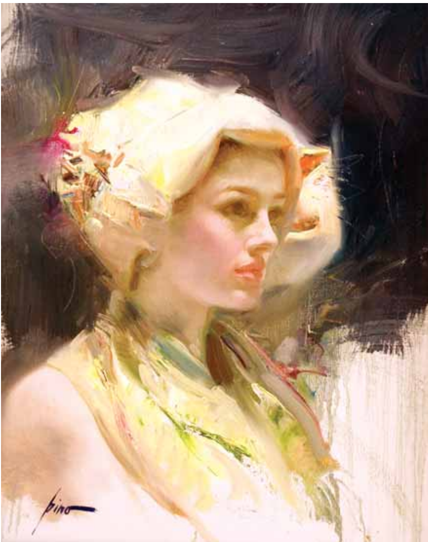
PINO, WRAPPED IN YELLOW, OIL ON CANVAS, 29 X 16"

Plam has been drawn to still lifes for most of her career because of the creative freedom they give her in both set up and the actual painting process.